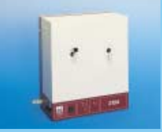
Order No. 2946

consisting of hoses for water inlet and outlet (1.5 m) and hose clips, in connection with Separate Water Supply 2901 or 2909