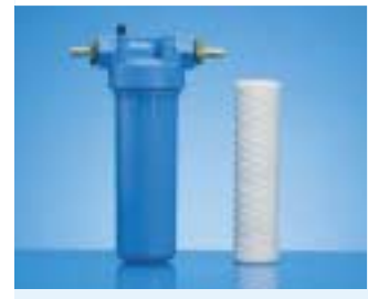
Order No. 2912

Spare Filling for Phosphate Cartridge Order No. 2907