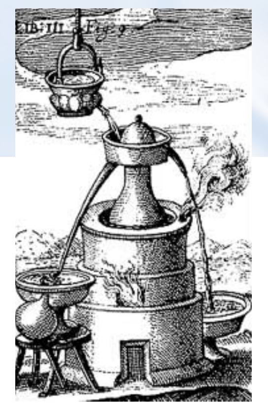
Alambic with water cooling around the distillation helmet.

In the developmental history of distillation equipment, this unconventional model disposes of a cooling basin shaped like an oriental turban.