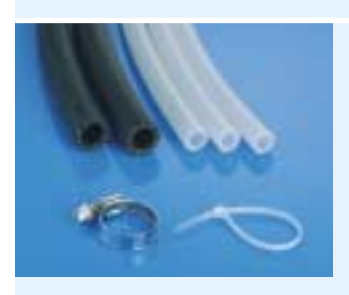
Order No. 2948